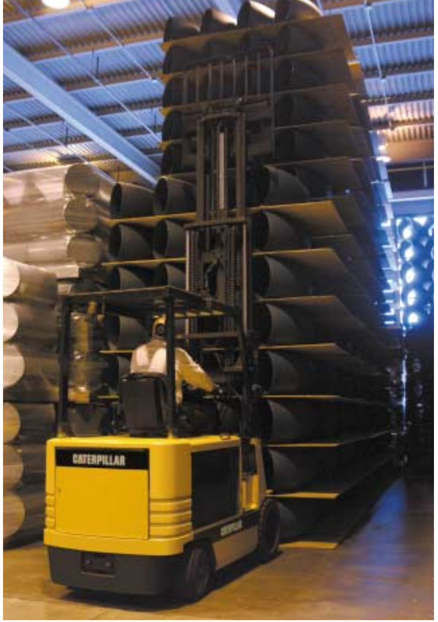
Above: Four 2EC30 electric Cat lift trucks help share the double-shift workload at this busy 330,000-sq.-ft. facility.