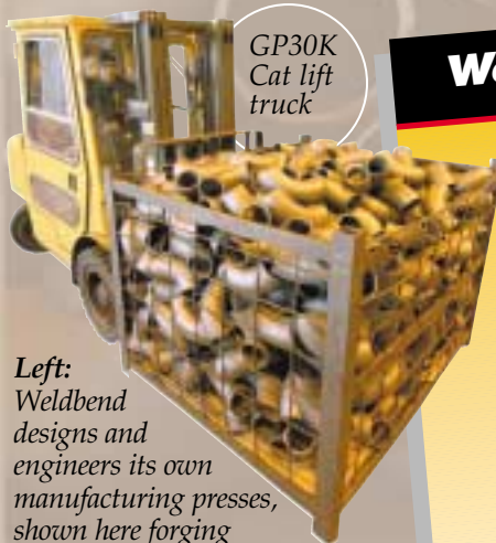
GP30K Cat lift truck

Left: Weldbend designs and engineers its own manufacturing presses, shown here forging an elbow fitting.