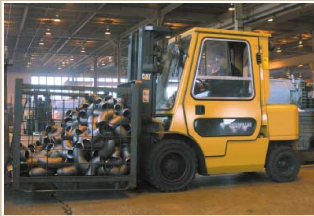
This GP30K Cat lift truck, the newest addition to Weldbend's fleet, moves one of the many loads of fittings.